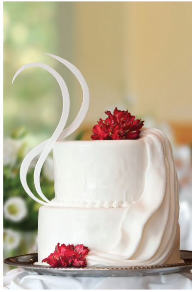
ENCHANTING PEARL $9 (26-50 guests)