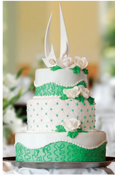
BRIDAL BLISS $10 (51-100 guests)