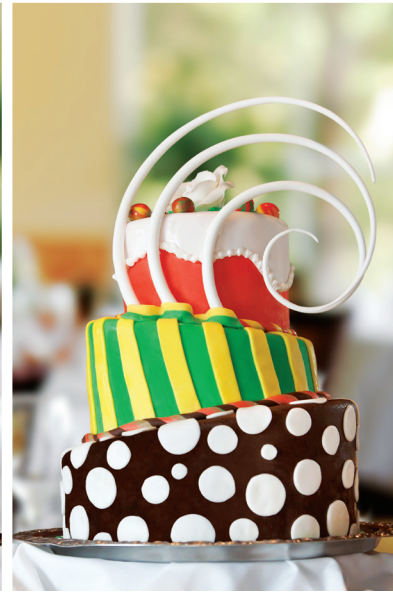
TROPICAL ELEGANCE $11 (51-100 guests)