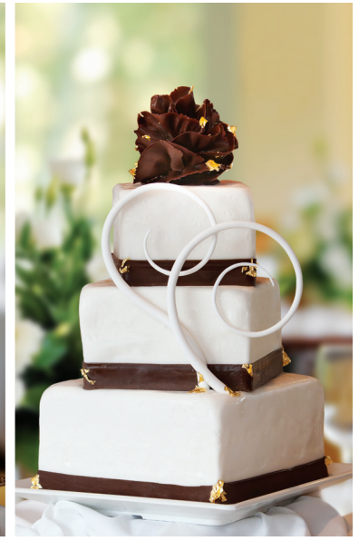
SIMPLE AND SWEET $11 (101-150 guests)

There are no substitutions unless there is an allergy or special dietary reason.