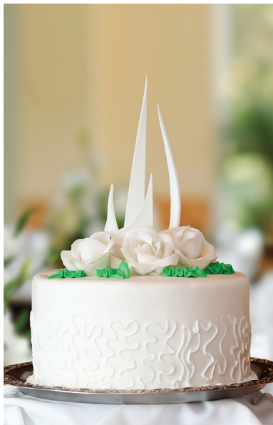
SHIMMERING ROYALTY $8 (up to 25 guests)

Vanilla, Chocolate, Mocha, Coffee, Caramel, Pistachio, Strawberry, Raspberry, Blueberry, Orange, Lemon, Pineapple